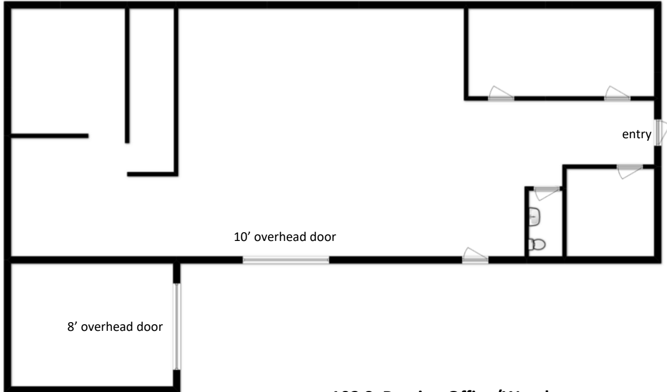
102 S. Bowie - Office/Warehouse