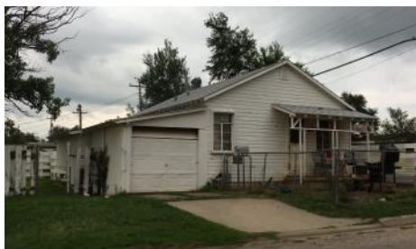
2811 NE 10th